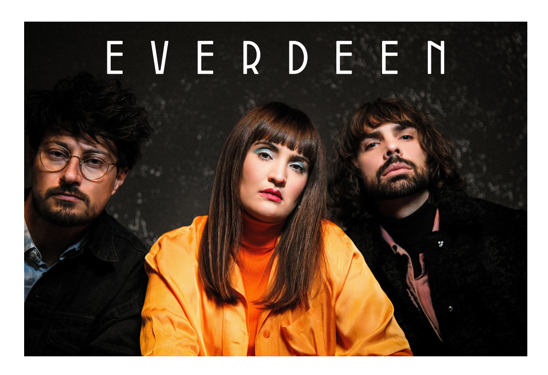
TECHNICAL DIDER - ENGLISH