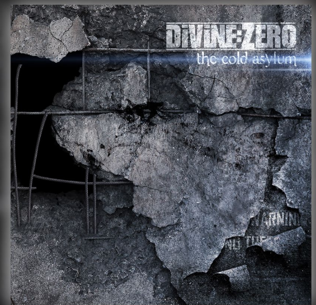
the cold asylum - Okt. 2014