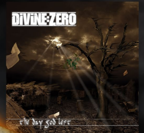
the day god left - 2008