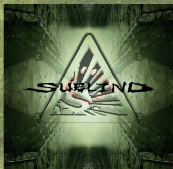
THRASH IT! MINI-EP, 2009