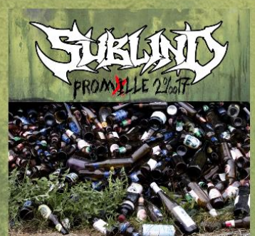
PROMILLE 20017 PROMO-EP, 2017