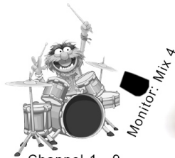
Channel 1 - 9