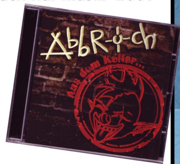
„Aus dem Keller...“ 2011