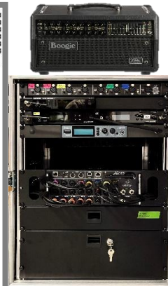
5 x 230V