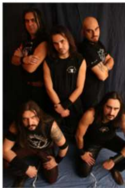
Tarchon Fist 2008