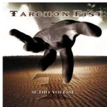
Se Dio Volesse