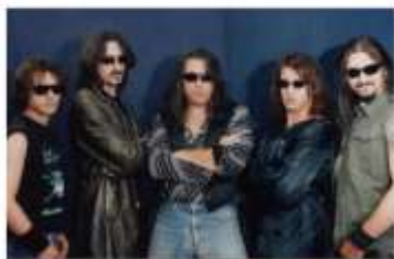
Tarchon Fist 2005