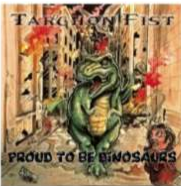
Proud To Be Dinosaurs

Tarchon Fist, even without drummer, started to work hard for 4 new tracks that would have been the preview of the new album. The idea was to create a full-length where all the tracks were linked together. The four songs mentioned formed an independent route which would be gathered in an EP. The idea to cut "Proud To Be Dinosaurs" was born.