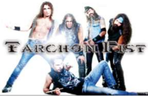
Tarchon Fist 2015

traditional European locations, played for the first time in Poland and Spain. In 2016 the historical German magazine "Rock Hard" published a compilation, enclosed to the magazine, including Opeth, Testament and other big bands, among which the Tarchon Fist.