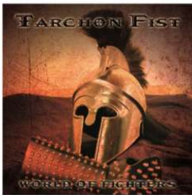
World Of Fighters LP

As usual Tarchon Fist went on working hard both in live and studio activities. At the end of 2011 Tarchon Fist realized that a renewal was necessary for the release of their new album starting right from their appearance. Hence the decision to recreate the band look in a military style, including the cd cover and all the gadgets.