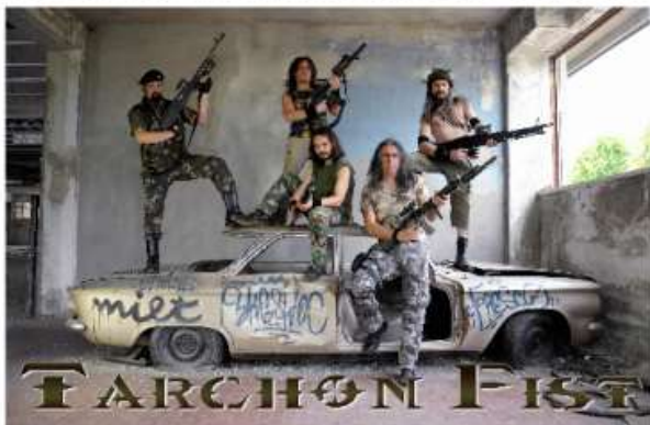
Tarchon Fist 2012

In 2012 the band, in addition to the work on the new album, went on performing on live stages: in France and particularly in Czech Republic Tarchon Fist got a great success. The purpose of Tarchon Fist was to bring Italian Metal around Europe in a short time . On October 1st the new cd "Heavy Metal Black Force" (My Graveyard Productions) finally came out. It is important to underline that on the 12 tracks there were all the 4 guitarists who had the opportunity to be part of Tarchon Fist! The album, called "Heavy Metal Black Force" was presented on October 4th in Bologna, on 5th in Brescia and on 12th in Padova where the band played without any supporting groups, with a totally unpublished bill. All the new lyrics and a