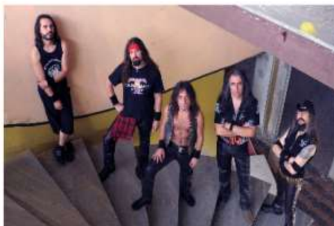
Tarchon Fist 2011

As usual Tarchon Fist went on working hard both in live and studio activities. At the end of 2011 Tarchon Fist realized that a renewal was necessary for the release of their new album starting right from their appearance. Hence the decision to recreate the band look in a military style, including the cd cover and all the gadgets.