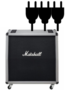
Guitar / Marshall JCM800 or Silver Jubilee